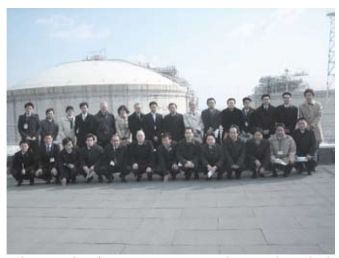
Delegates to the February 2012 Japanese members' meeting gather in front of the tanks at the Sakai LNG terminal

Two other gas carrier and gas-handling initiatives with which SIGTTO has close involvement are currently making progress at IMO. The latest status of the revised International Gas Carrier (IGC) Code and the new International Code on Safety for Gas-Fuelled Ships (IGF Code) is described on pages 9 and 7 in this newsletter.