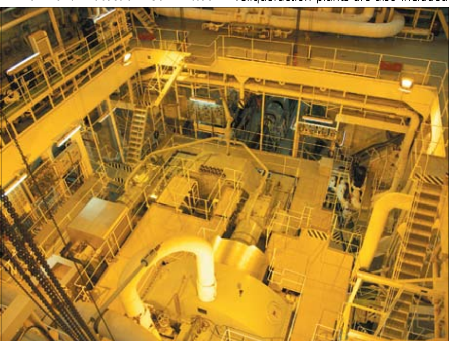
There is still no agreement on how steam turbine-powered LNG ships will be treated by the proposed EEDI regime

LNG carriers powered by slow-speed diesel engines and fitted with reliquefaction plants are also included