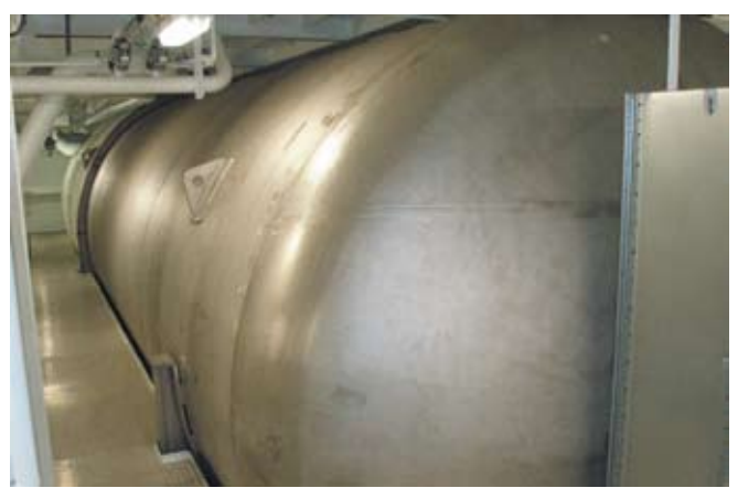
An LNG bunker tank on a Norwegian cross-fjord ferry

Progress by the IGF working group during BLG 16 included a review of the later chapters of the Code and, as a result of this work, the group identified a number of areas where