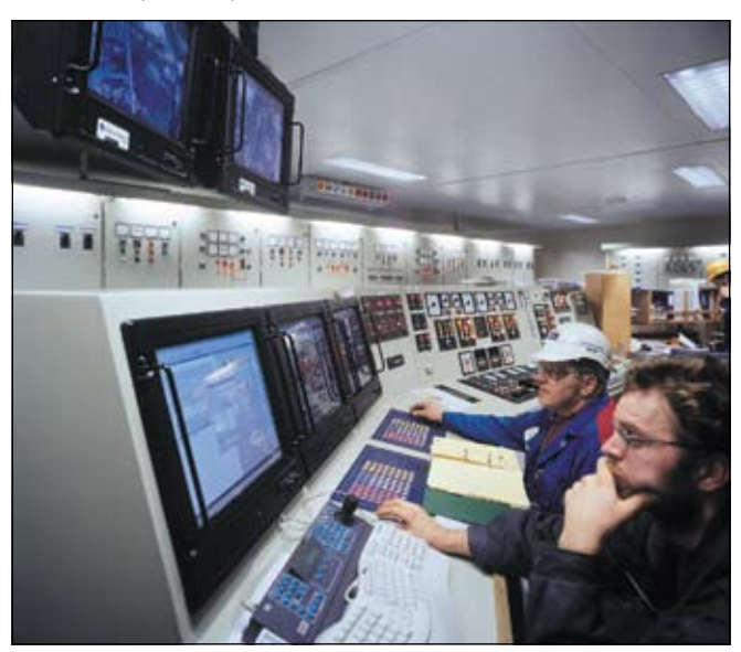
Most seafarers find hands-on training and simulators offer the best route to skill enhancement

The working group has reviewed the results of the survey and prepared terms of reference for submission to the GPC in March 2012. Details of the survey results can be made available upon request.