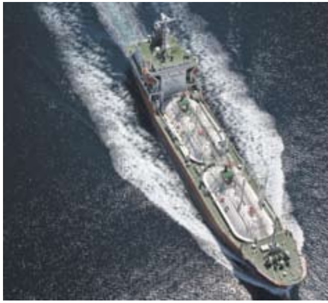
Vitol has the largest fleet of chartered, fully pressurised LPG carriers

Established in Rotterdam in 1966, the Vitol Group is now the world's largest independent energy trader. As two of the fastest-growing energy sectors, LNG and LPG represent an increasingly important part of the trading portfolio. Vitol delivered over 2 million tonnes of LNG in 2011, making it the largest independent trader of this product. Customers are supplied on both a long-term and spot basis.