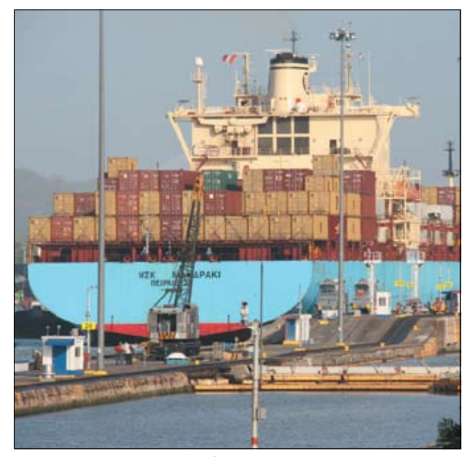
While locomotives are employed for transits through the existing waterway, they will not be used with the new locks

Future charter parties are likely to require Panama Canal compatibility. It is recommended that shipowners consider making any adjustments needed to ensure compliance with the Canal's published vessel requirements during a suitable maintenance period.