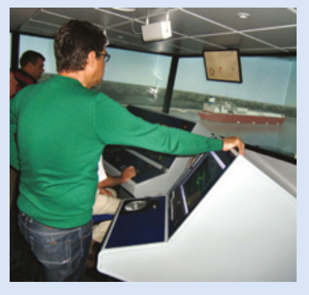
Training establishments are a new SIGTTO Associate Member category

SIGTTO membership ranks, provided certain criteria are complied with. It is considered advantageous to allow training establishments/providers to become associate members of the Society due to the competencies and experience such institutions will bring into the Society. They will also encourage rapid dissemination of SIGTTO's guidelines and standards through their training courses.